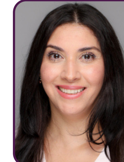
Assile Al-Amili Arabic Language