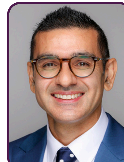
Tariq Bell Secondary