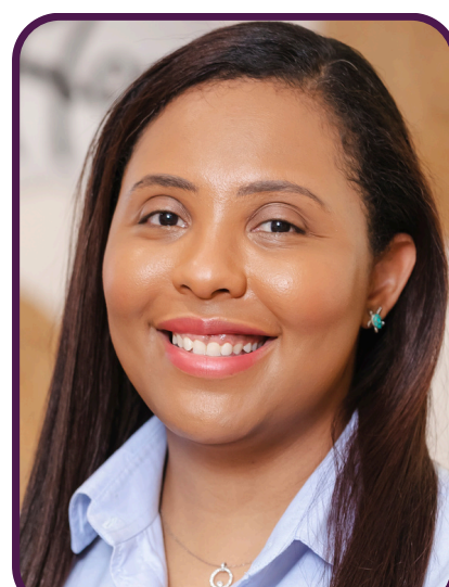
Philippa Wallace Nursery